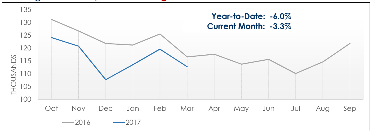
Average Weekday Bus Boardings